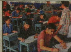
JEE merit list is out but doesn't count re-evaluated Class XII marks